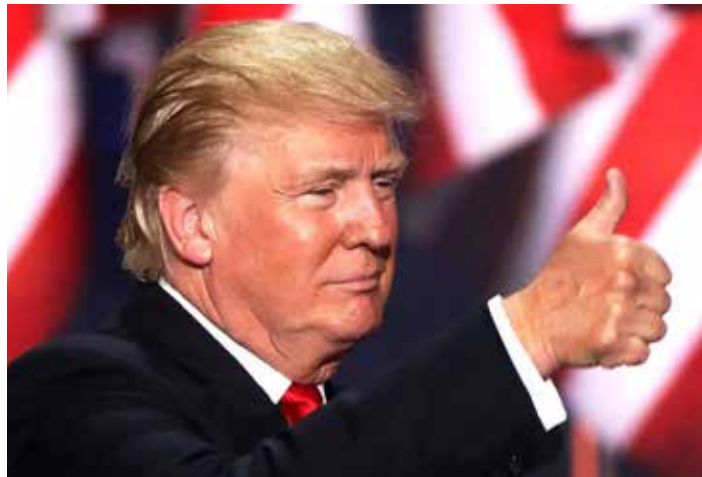
Donald Trump... inducing greater consumer confidence.

Based on the study's lumber supply curve analysis, the major supplying regions include Brazil, Chile, Germany and the Nordic countries.