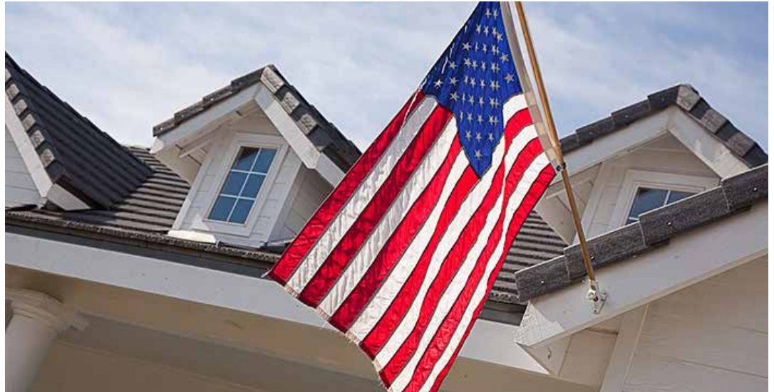
On the rise... stronger US economy is heating up the home-building sector.

Donald Trump, so far at least, has not led the US down the path of economic ruin that critics predicted. At a minimum, he seems to have helped induce greater confidence in business, consumers and investors,