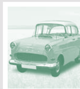
With ORSON WHEELS

central storage bin includes two USB connection points and a power source, which runs alongside a second power source underneath the air-conditioning controls.